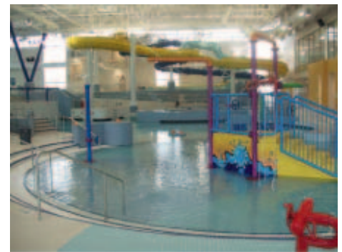
Mission Recreation Park Aquatic Centre - Kelowna, BC

The Mission Recreation Park Aquatic Centre is a state-of-the-art facility that allows individuals of all ages to get involved in the largest publicly-owned water park in Canada. Underneath the facility's surface, innovative features and technologies can be found; in particular, lighting selections, and energy saving opportunities.