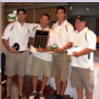
BCEA Golf Tournament June 2009 Sunset Ranch Kelowna