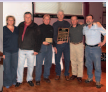
BCEA Curling Bonspiel March 2009 Richmond Winter Curling Club