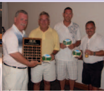
BCEA Golf Tournament July 2009 Surrey Golf Course