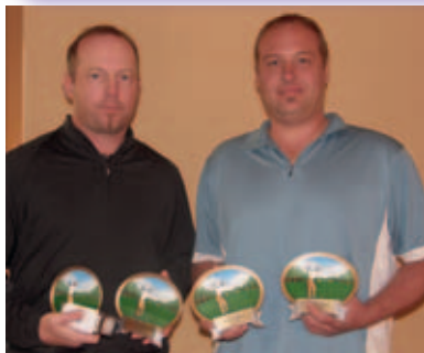
VEC/BCEA Golf Tournament May 2009 Gorge Vale Golf Course